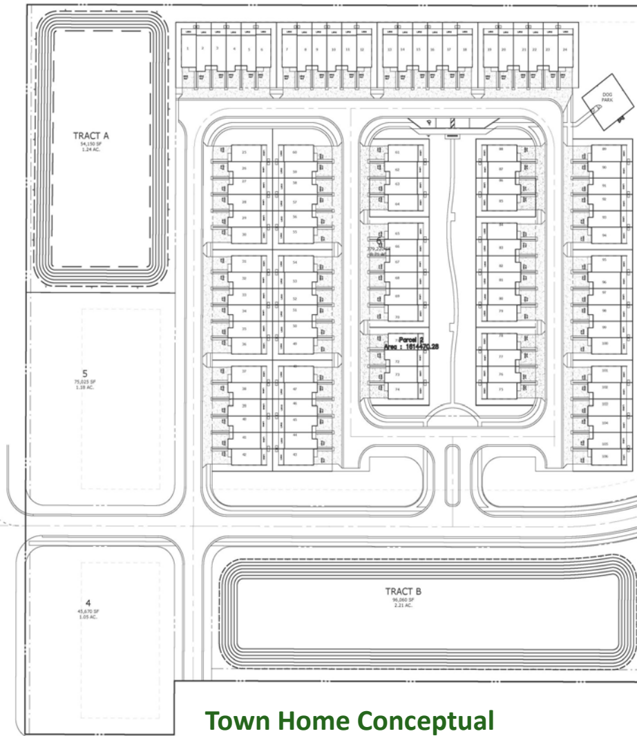
Town Home Conceptual